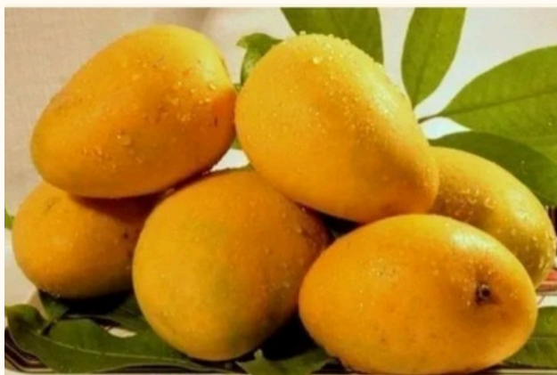
KESAR MANGOES THE QUEEN OF MANGOES